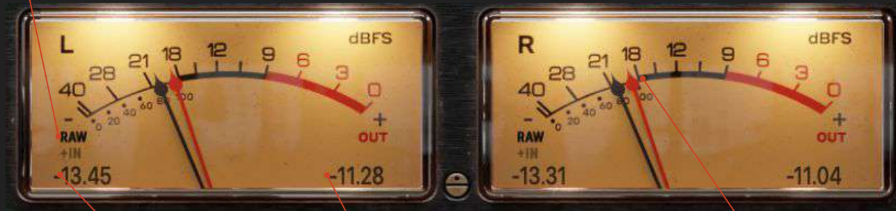
Modern VU Theme

This makes it easy to monitor your signal before and after input gain adjustments.