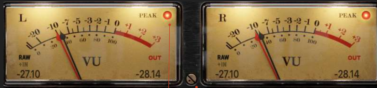
Classic VU Theme

-18 dBFS is calibrated to the 0 VU on the analog VU meter with a 1:1 relationship. So a -12 dBFS is +6 VU